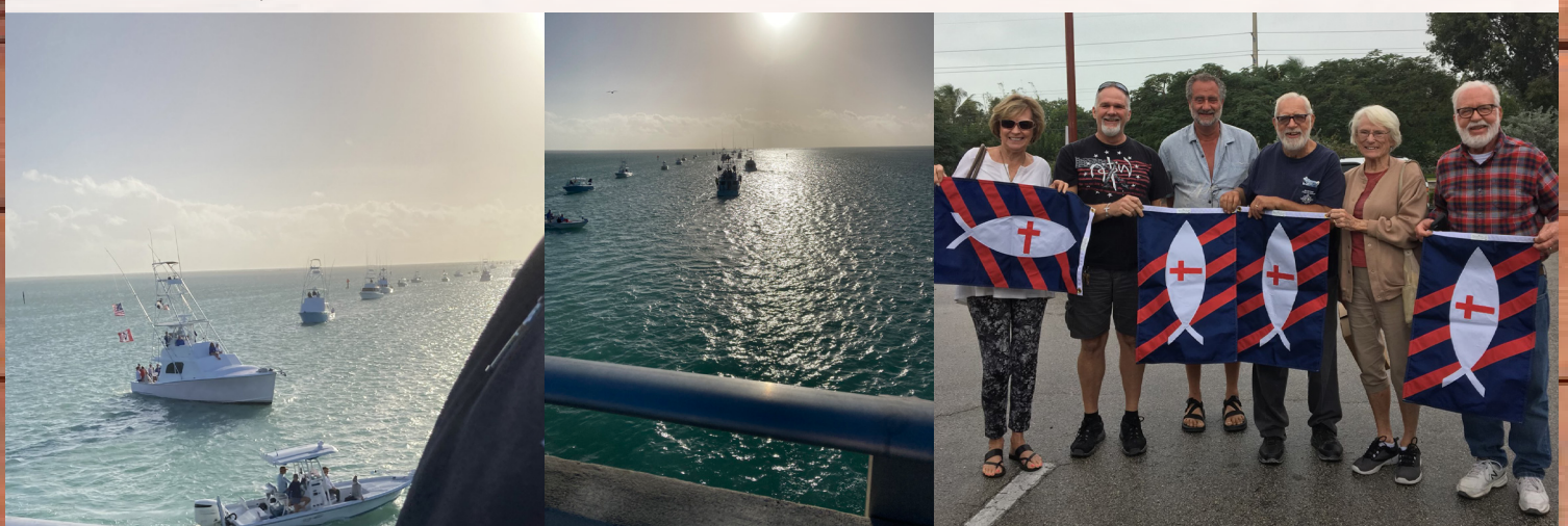
Blessing of the Fleet: January 1st 2021 Islamorada, Florida