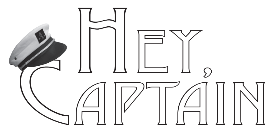
By Keith Houseknecht

ife lines, pelican hooks, turnbuckles and miscellaneous other parts are all important for marking the edge of your boat and to a small degree keeping your crew on board. The system for keeping your crew on board is your hand rails, jack lines, tether and harness. I realize that we might sit and lean on the life lines when you are racing but when moving around deck staying away from the life lines is best. It is just too easy for a misstep, wave, line or sail to knock us in the drink. There are strong hand rails in the opposite direction of the life lines. That is what we should rely on.